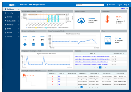
Intel® Data Center Manager Console Dashboard

Intel® Data Center Manager 5.0 introduces new features to empower data centers to take control of their sustainability goals.